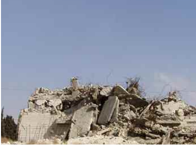
A demolished Palestinian home in Jerusalem

During the first weeks of the uprising, Israeli forces shot one million live rounds at unarmed protesters. This use of force expanded to include tanks, helicopter gunships and even F-16 fighter planes, and civilian neighbourhoods and PA institutions were subjected to shelling and aerial bombardment. This was a conscious escalation in the use of force designed to avoid a protracted civil