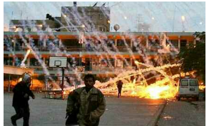
Israeli warplanes drop outlawed white phosphorous bombs on a UN school in Gaza in 2009

After this mini-civil war, Israel tightened its siege of Gaza, the tiny coastal enclave which is home to two million people, the vast majority of them refugee families from 1948, more than half of them minors. This blockade is a form of illegal collective punishment with the aim of undermining the Hamas administration. That this is the goal of the siege has been repeatedly and openly admitted by Israeli officials. This cruel siege has endured and been an aspect of daily Gazan life ever since. With a regime of punishing economic sanctions, a dearth of medical supplies, artificially-imposed food, water and electricity shortages, arbitrary exclusion zones for – and attacks on – farmers and fishers, an unemployment rate of over 50% (the highest in the world), and frequent military incursions, Gaza remains constantly on the brink of a huge man-made humanitarian catastrophe.