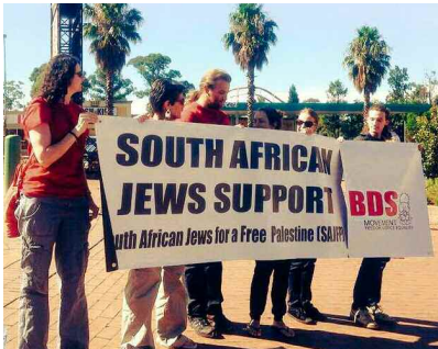
South African Jews for a Free Palestine supporting BDS

It is worth addressing a claim that frequently comes from Israel's apologists. Israel cannot be an apartheid state they say, because there are 'Arabs who are members of parliament, legal officials, police and soldiers, models and entertainers, and so on' and there are, formally at any rate, no separate restaurants, hotels, swimming pool, toilets, public transport, etc. While there are indeed Palestinians holding such offices or societal positions, and – theoretically at least – there is no such 'official' physical segregation within the state (as opposed to within the territories it occupies), this by no means absolves Israel of the Crime of Apartheid.