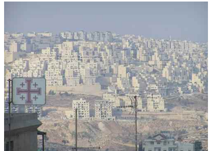
The illegal settlement of Har Homa overlooks the city Bethlehem

Almost immediately after the end of the 1967 conquest, Israel began the process of colonising the land, building Jewish-only settlements in the occupied territories. All such settlements – whether in occupied Palestine or occupied Syria – are illegal under international law, and are considered war crimes under the Geneva Conventions. This is the position of the UN Security Council, the UN General Assembly, the European Union, the governments of Ireland and Britain, the International Court of Justice and all respected human rights organisations. Article 49 of the Fourth Geneva Convention states that it is illegal for an occupying power to “deport or transfer parts of its own civilian population into the territory it occupies”; all such settlements are thus war crimes. UN Security Council Resolutions 446 and 2334 declares settlements have “no legal validity” and are “flagrant violations of international law”.