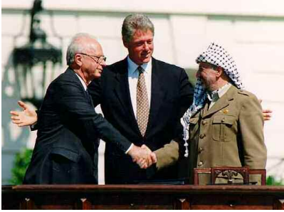
Yitzhak Rabin and Yasser Arafat shake hands in front of Bill Clinton in the White House in 1993

peace, these agreements in fact failed to adequately address the demands of the Palestinian people who had sacrificed so much for their freedom, not least during the Intifada.