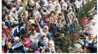
Palestinian women lead a protest during the First Intifada

demonstrations, boycotts, refusal to comply with occupation forces, 'illegal educational activities' as Israel closed educational facilities; the flying of 'illegal' Palestinian flags and writing of revolutionary graffiti; and confrontations between stone-throwing youths and the heavily armed occupation forces.