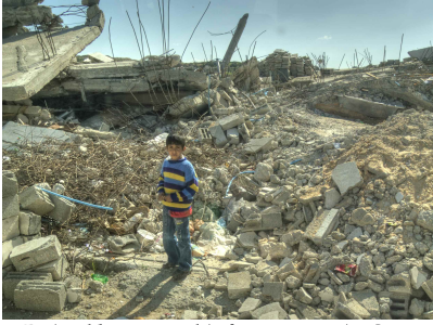
Ruined houses and infrastructure in Gaza following the 2014 Israeli assault

(including more than 900 children), tens of thousands more wounded, maimed or traumatised, innumerable homes and facilities destroyed, and the civilian infrastructure of Gaza in ruins, and we are left with an incredibly bleak picture.