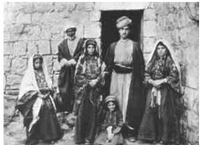
A Palestinian family before the Nakba

Britain promised a land that was not theirs to a colonial movement that sought to build an ethno-nationalist state at the expense of the indigenous Arab Palestinians, laying the foundation for what would become the ethnic cleansing of Palestine and the creation of the Apartheid State of Israel. Zionism was very much an extremist minority position in the wider Jewish world at this time.