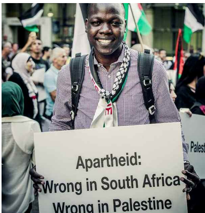
Wrong in South Africa, Wrong in Palestine'

There is overwhelming evidence that the system instituted by the Israeli government against the Palestinian people meets the UN definition of Apartheid.