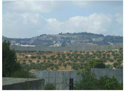
An inaccessible Palestinian olive grove near Bethlehem, cut off by the Apartheid Wall

Much arable land is either off limits to Palestinian farmers, or has simply been stolen by settlers. What land that is accessible is often the subject of violent attacks by settlers (protected by the occupation forces) with the uprooting of olive trees or the burning of crops. Israel controls all borders and entry points and arbitrarily denies the entry and exit of both people and goods. The unemployment rate is 18%; many of those who are employed work in construction inside Israel, and, in a bitter irony, often in building illegal settlements. Enforced poverty is compelling these workers to build the very settlements that are contributing so much to the collective misery of the Palestinian people.