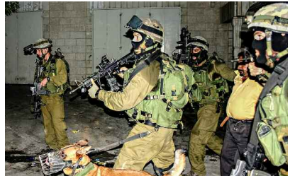
A night raid in a Palestinian village by Israeli occupation soldiers

Killings of Palestinian civilians are frequent. Military raids on villages to drag people, mostly young men and boys, from their beds in the middle of the night are a nightly occurrence; thousands of political prisoners, including hundreds of children, are incarcerated as a result.