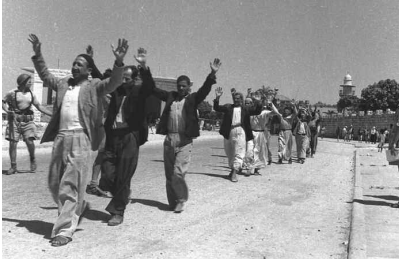
Palestinians rounded up by Israeli forces in the Lydda-Ramle area. Some 70,000, were expelled in what became known as the Lydda Death March

The surviving Palestinian exiles of 1947-49 and 1967 and their descendants, at a conservative estimate, number around five million people, and make up the Palestinian refugee population. Most live in the surrounding countries of Lebanon, Jordan and Syria where they face uncertainty, precarity and oftentimes severe discrimination – both formal and informal. The remainder, some two million, live in refugee camps inside