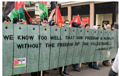
Scottish protesters carry a wall with Nelson Mandela's famous quote 'We know too well that our freedom is incomplete without the freedom of the Palestinians'

Segregation is carried out by implementing separate legal regimes for Israelis and Palestinians living in the same area. For example, Israelis living in the illegal Israeli settlements in the occupied West Bank are governed by Israeli civil law, while Palestinians also living in the occupied West Bank are governed by Israeli military law. Within the state of Israel, Palestinian citizens, who according to Israeli propaganda are afforded the same rights as Israeli Jews, are in fact subject to over 65 discriminatory laws, are not free to live wherever they choose, experience horrific incitement, and live in fear of forced transfer from their homes.