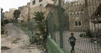
A segregated street in Apartheid South Africa (above) and a segregated street in Israeli-occupied Hebron in Palestine.

Apartheid is an Afrikaans word for ‘apartness’ or ‘separation’, which was originally used to describe the system of racial discrimination that existed in South Africa between 1948 and 1994. However, today the term Apartheid is used in international law to describe a category of regime, defined in the United Nations (UN) International Convention on the Suppression and Punishment of the Crime of Apartheid (1973), and refined in Article 7 of the Rome Statute of the International Criminal Court in 2002.