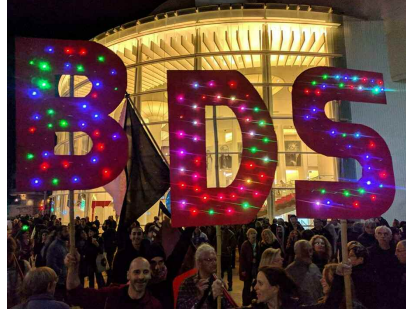
BDS activists from Boycott From Within in Tel Aviv

chosen based on their relationship to the Apartheid State of Israel and its ongoing violations of human, civil and democratic rights, and its breaches of international law. From the protests of the Irish Land League – where the word boycott was originally coined – to Ghandi’s anti-British goods boycott, to the Jewish anti-Nazi boycott, to the Montgomery bus boycott, to LGBTQ+ anti-homophobia boycotts and the fossil fuel divestment