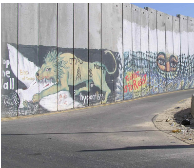
‘To Exist is To Resist’ – Mural on the Apartheid Wall in Bethlehem

At the time of writing, the ongoing ‘Great March of Return’ protests in Gaza have seen some 200 unarmed protesters, including women, children, medics and journalists, deliberately shot and killed, and thousands more wounded – and often permanently disabled – by live fire.