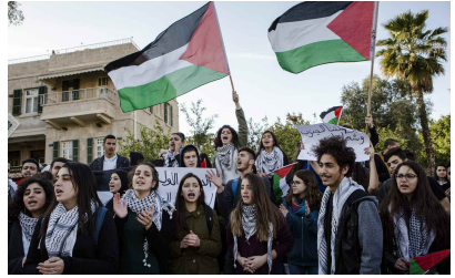
Palestinian citizens of Israel protest against discrimination in education

Often referred to as 'Israeli Arabs', though the vast majority do not identify in this way, these are the Palestinians who managed to survive death or expulsion during the Nakba, who became involuntary citizens of the Apartheid State of Israel, and their descendants. Today they number just under 2 million, and make up 20% of the population of the state. According to the US State Department, they face severe "institutional, legal, and societal discrimination".