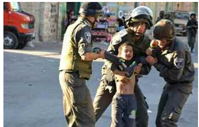
Israeli occupation forces arrest a young boy in Hebron

At any given time there are somewhere between 5,000 and 7,000 Palestinian political prisoners in Apartheid Israel’s prisons. Of these, between 200 and 300 will be children.