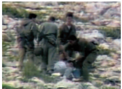
A video showing Israeli soldiers using rocks to break the bones of a Palestinian youth

Meanwhile, over 175,000 Palestinians were jailed during the Intifada, and in 1990 alone just one Israeli prison held approximately one out of every 50 Palestinian males over the age of 16. During this period Israel had the highest per capita prison population in the world, and the Israeli human rights group B'Tselem estimates that around 85% of prisoners were subjected to torture.