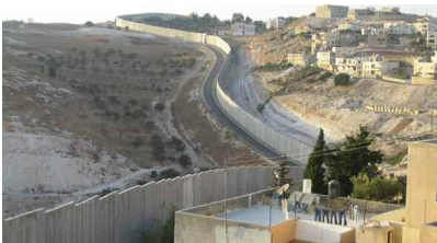
The Apartheid Wall cuts Palestinians off from their land

The Apartheid Wall – sometimes called the Separation Barrier – which snakes through the region, the settler-only roads that criss-cross it, and the illegal settlements the wall is there to entrench, combine to choke the life out of the West Bank.