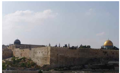
The Al Aqsa Mosque compound in Palestinian East Jerusalem

Palestinian East Jerusalem was part of the territory captured in 1967 by Israel, which immediately began moving illegal settlers into the eastern part of the city in violation of the Geneva Conventions. Ever since, Israel has attempted to reduce the city's population of Palestinians and expand the illegal Jewish-Israeli settler population. The steps taken to achieve this goal include the isolation of East Jerusalem from the West Bank, land