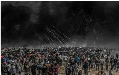
Palestinians protestors on the Great March of Return in Gaza

In both the West Bank and Gaza, the killing and maiming of Palestinians by both occupation forces and illegal settlers continue apace and with complete impunity. For example, in 2013 an Israeli human rights group noted that in the cases of the more than then 6,500 Palestinians killed since September 2000, Israel opened only 179 investigations, and not a single one resulted in a murder conviction.