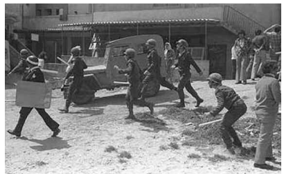
Israeli forces attack Palestinian protesters on the first 'Land Day', March 30 1976. Six unarmed demonstrators were killed and scores injured and arrested

In Israel, unlike in virtually every other country, there is a distinction between 'citizenship' and 'nationality'. While citizenship is conferred upon all regardless of ethnic origin, these citizens are defined by their 'nationality' – Jewish, Arab, Druze, etc. There is no such thing as an Israeli nationality (something that has been tested in court) and this has very real practical effects for non-Jewish citizens. Israel calls itself the 'nation state of the Jewish people', and unlike any Western country, it is emphatically not a state of all its citizens, but a state in which non-Jewish citizens are, at best, merely tolerated.