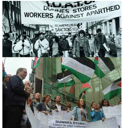
The famous anti-apartheid IDATU strikers who took a stand against Dunnes Stores’ stocking of products from Apartheid South Africa on a protest in 1986 (above) and BDS activists from the IPSC outside Dunnes Stores head office calling for an ending to the stocking of goods from Apartheid Israel in 2010. Some of the people are in both images.

roads throughout the West Bank, segregated walkways in Hebron, ‘admission committees’ in small towns, different coloured license plates and ID cards, and so on – it most certainly displays all the hallmarks of Grand Apartheid. We see denial of political representation to millions who live under its rule (some token Palestinian politicians in the parliament notwithstanding), economic discrimination, the denial of freedom of movement based on ethnicity, legalised inequality before the law (some token Palestinian judges notwithstanding), the denial of the right for Palestinians to return to their homeland, and, of course, the crushing system of oppression and repression that ensures that this brutal racist system remains in place.