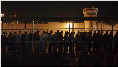
Palestinian workers begin queuing before dawn to cross an Israeli checkpoint in order to ensure they make it to work on time

Meanwhile, things are little better in the West Bank where three million Palestinians live. Here, despite the nominal Palestinian Authority control in ‘Area A’, Israeli occupation forces continue to control almost every aspect of Palestinian lives, from the moment they wake to go to work until they retire to bed.