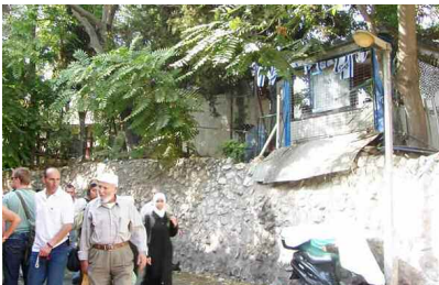
An illegal Israeli settlement compound in Palestinian East Jerusalem

According to Israeli professor Oren Yiftachel, all these policies are part of a plan to ‘de-Arabize’ Palestinian East Jerusalem.