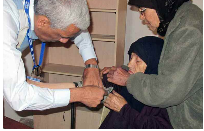
UNRWA medical personnel providing vital healthcare to refugees in Syria.

As part of the Trump-Netanyahu axis of racism, the US has cut all funding to the United Nations Relief and Works Agency for Palestine Refugees (UNRWA), the UN agency that provides medical care and education to millions of refugees. This is a part of the US-Israeli strategy to ‘de-refugeeify’ Palestinian refugees – however it has no legal validity and will not stop the refugees’ fight for their right to return and live in peace in their homeland.