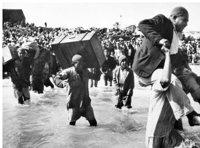
Palestinian refugees flee their homes onto boats during the Nakba

Following the Second World War, the Nazi Holocaust, and the resulting immigration of many thousands of European Jewish refugees into Palestine, the Zionist movement experienced a huge growth in support and confidence. Building on their attacks on British forces stationed in Palestine during and after the war, and following the UN's undemocratic vote to partition historic Palestine against the wishes of the indigenous people, from 1947 Zionist paramilitary groups began the process of a calculated ethnic cleansing of Arab Palestinians.