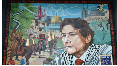
A mural of Palestinian intellectual Edward Said in the West Bank

each other, restriction of freedom of movement based on an ID-card system, Israel's occupation was in fact deliberately entrenched. There was never any intention to grant Palestinians their right to self-determination or freedom.