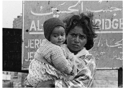
Palestinian refugees fleeing to Jordan in 1967

days the Israeli military had defeated these three Arab armies and occupied the rest of Palestine (Gaza, the West Bank and East Jerusalem), the Egyptian Sinai, and the Syrian Golan Heights. The Palestinians in these territories then fell under Israeli rule, and have been subjected to a brutal military occupation and apartheid regime ever since. A further 300,000 Palestinians were expelled into the refugee diaspora. Palestinians refer to this period as Al Naksa , Arabic for 'The Setback', and it is marked annually on 5th June.