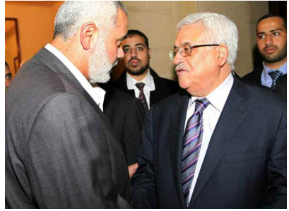
Hamas leader Ismail Haniyeh (left) and Fatah leader Mahmoud Abbas

To counter this, a Palestinian national unity government was formed – yet this too was unacceptable to the US and Israel. Seeking to overthrow the democratically elected government, the US connived with elements of Fatah to stage a military coup that would oust Hamas. However, details of this so-called ‘Plan B’ leaked, and Hamas instigated a counter coup. The ‘Battle of Gaza’ saw 160 people, mostly partisans for each side, killed and left Hamas in control of Gaza and Fatah in control of the West Bank. These bitter divisions and their enduring wounds were and remain a tragedy for the Palestinian people, severely compromising the unity that is needed to end Israel’s occupation and apartheid.