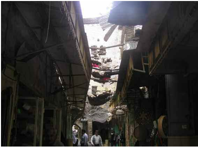
Netting erected in Hebron's old city market district to catch rubbish thrown by illegal settlers who have taken over residences above

Land has been expropriated to pave hundreds of kilometers of apartheid settler-only roads; roadblocks, diversions and checkpoints that deny freedom of movement to Palestinians are erected based on the location of settlements; Palestinians have been denied access to much of their farmland; and the Apartheid Wall (begun in 2003, and deemed illegal by the International Court of Justice in 2004) was built in order to leave as many settlements as possible – and lots more Palestinian land – on its western side. Although in theory settlements take up only around 2% of the West Bank, it is estimated that up to 40% of Palestinian land in this area is totally off limits to Palestinians as a result of various factors owing to the presence of the illegal settlements.