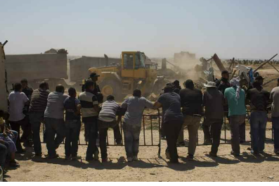
Bedouin watch the demolition of their 'unrecognised' village of Al-Araqib in the Naqab (Negev) Desert, which has been demolished over 140 times

of their ethnicity, ranging from the 'legalised' theft of land, to the denial of residency and citizenship to OPT Palestinian spouses of Palestinians, to the criminalising of boycotts. The most fundamentally discriminatory law of all is Israel's so-called 'Law of Return' whereby anyone with a Jewish grandparent can move to Israel and become a citizen. At the same time, Israel continues to deny Palestinian refugees