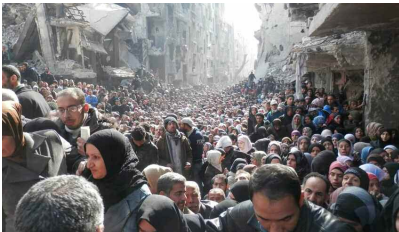
Palestinian refugees queue for food in Yarmouk refugee camp in Damascus during the Syrian Civil War

For seven decades Israel has refused Palestinian refugees their Right of Return; UN General Assembly Resolution 194 states that Palestinian “refugees wishing to return to their homes and live at peace with their neighbours should be permitted to do so at the earliest practicable date.” This resolution has been reaffirmed many times over by UNGA. Opponents of Palestinian rights claim 194 is irrelevant as UNGA resolutions are non-binding; however Israel’s accession to the UN was predicated upon its