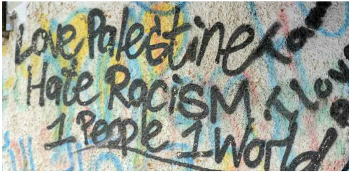
'Love Palestine, Hate Racism' graffiti in Nablus

Overwhelmingly, however, those who make claims about BDS being 'antisemitic' are doing so in an attempt to discredit the movement and isolate Israel from both political criticism and effective action to compel it to end its injustices. While not