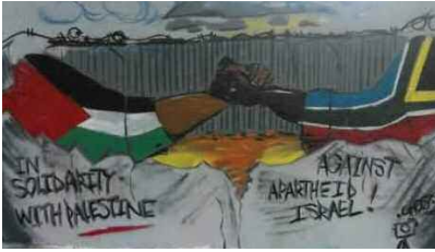
A mural at Wits University in South Africa declares solidarity between South Africa and Palestine's anti-apartheid struggle

Desmond Tutu has said that Israeli apartheid is a more brutal form than its South African counterpart, noting that Palestinians are “being oppressed more than the apartheid ideologues could ever dream about in South Africa”.