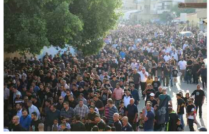
Palestinians citizens of Israel commemorate the Kafr Qasim massacre of 49 civilians by Israeli police

higher for Arabs than Jews, and Arabs tend to be employed in lower paid economic sectors; the average monthly wage for an Arab worker is €1,830 compared with €2643 for a Jewish worker, while Arab women on average earn only €1482 per month. Only 10% of civil service employees, and just 2.5% of all high-tech workers, are Arab.