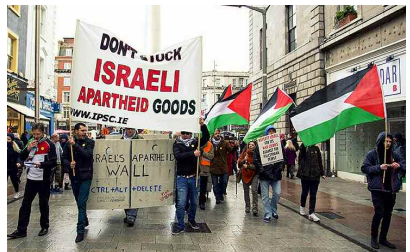
A BDS protest in Dublin, 2016

The BDS movement is supported by unions, churches, NGOs and movements representing millions across every continent and there are vibrant BDS campaigns in communities across the world. Progressive Jewish groups play an important role in the movement.