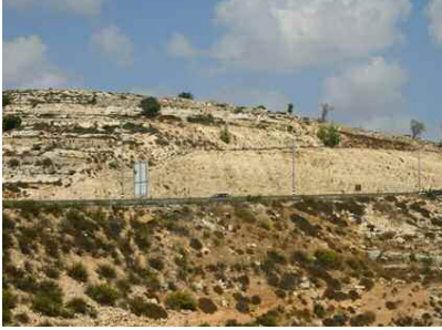
A settler-only 'apartheid road' in the West Bank, off limits to Palestinians.

illegal and highly pollutive industrial zones near Palestinian towns and villages.