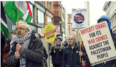
Protestors in Dublin call for a boycott of Israel due to its war crimes against the Palestinian people

Inspired by the South African anti-apartheid movement, in 2005 over 170 Palestinian civil society organisations called for boycotts, divestment and sanctions (BDS) as a form of non-violent pressure on Israel. Today the BDS movement is supported by over 200 Palestinian unions, refugee networks, women’s organisations, professional associations, popular resistance committees and other Palestinian civil society bodies.