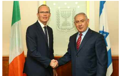
Israeli Prime Minister Benjamin Netanyahu meets with Irish Foreign Minister Simon Coveney in 2017

The Palestinian economy has been strangled by the Israeli occupation. The combined unemployment rate in the occupied Palestinian territories is 28%, the 9th highest in the world, and the World Bank currently places it 116th out of 190 economies. Furthermore, the World Bank estimates an annual loss of some US$285 million as a result of Israel's anti-Palestinian policies – without even figuring in additional losses due to things like export restrictions and denial of access to arable land. Israel also continues to frequently withhold large amounts of tax revenues that it collects on behalf of the PA.