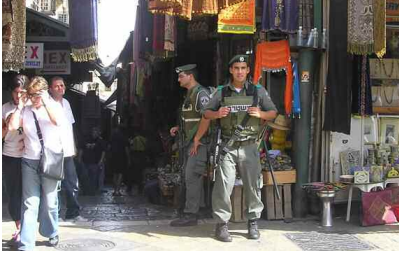
Israeli occupation forces in the Palestinian East Jerusalem

theft, and discriminatory policies in planning, construction and budgeting. Although the annexation of East Jerusalem and its residents was a decision made solely by Israel, Israeli authorities treat East Jerusalem Palestinians as if they had made a voluntary decision to immigrate to Israel.