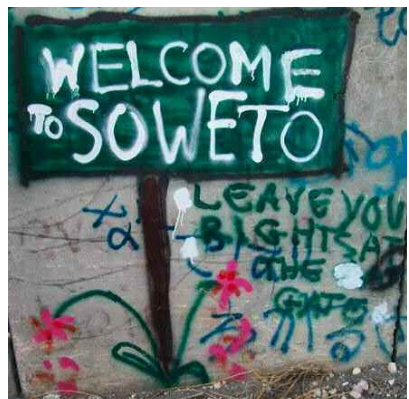
Graffiti on the Apartheid Wall in Palestine makes the connection with the infamous Soweto township in Apartheid South Africa.